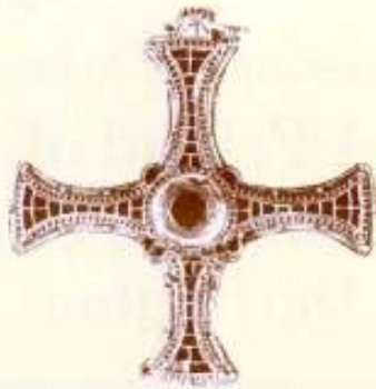
St. Cuthbert's Cross

St. Cuthbert's Church is the oldest building in Darlington town centre, and the only one to be Grade 1 listed. Completed between the years 1180 and 1240, with the exception of the addition of the spire in the 14th Century, little has been added since. It has been described as a Salisbury Cathedral in miniature, and is listed in Simon Jenkins' book 'England's Thousand Best Churches'.