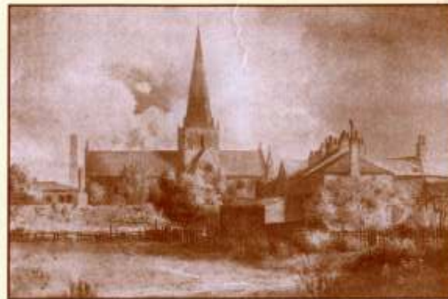
St. Cuthbert's Church in 1916

The parish of St. Cuthbert, Darlington is in the town centre and very few people live within it. Despite this, there is an average Sunday morning congregation of 100 people. St. Cuthbert's does not receive any financial assistance from outside bodies and has to meet all of the day to day running costs which are currently over £100,000 per year.